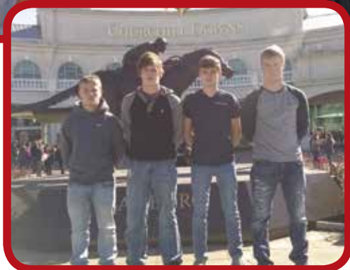
The CHS team also visited Churchill Downs during the FFA conference.