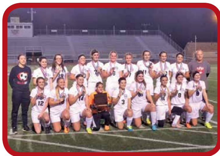
DISTRICT 6 CHAMPS! Congratulations!